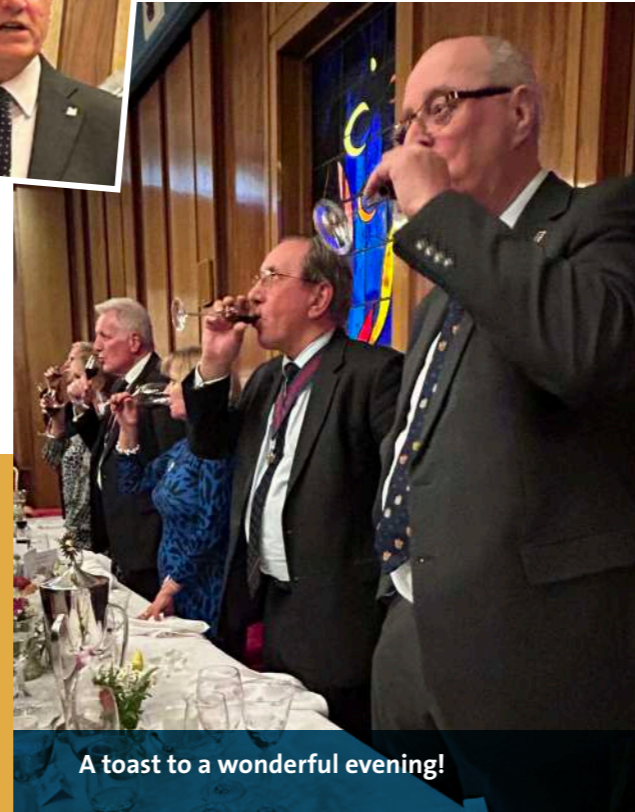
A toast to a wonderful evening!