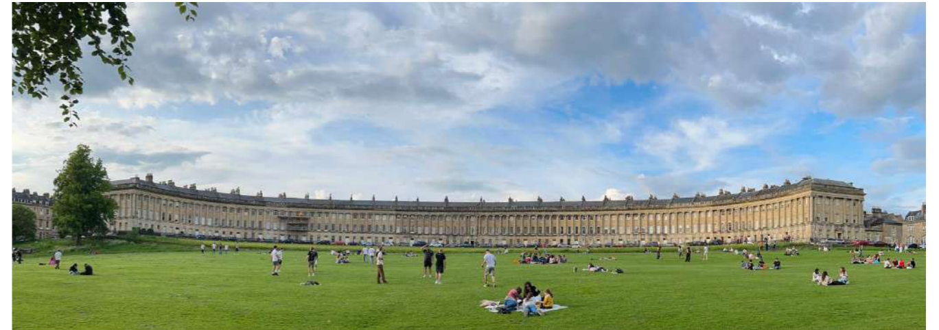
The weekend began with a visit to No 1 The Crescent, the most prestigious address in the City.

In May, the Master hosted his Master's Weekend in the historic City of Bath, where Liverymen, partners and guests relaxed and enjoyed the City's fascinating history.