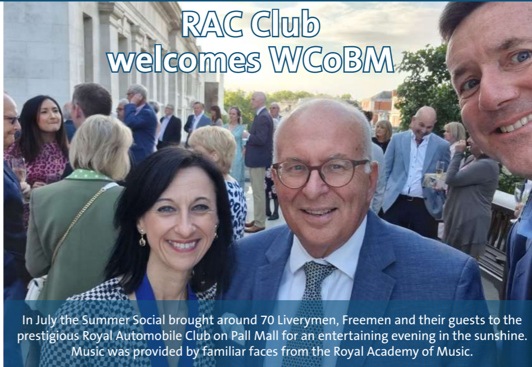
In July the Summer Social brought around 70 Liverymen, Freemen and their guests to the prestigious Royal Automobile Club on Pall Mall for an entertaining evening in the sunshine. Music was provided by familiar faces from the Royal Academy of Music.