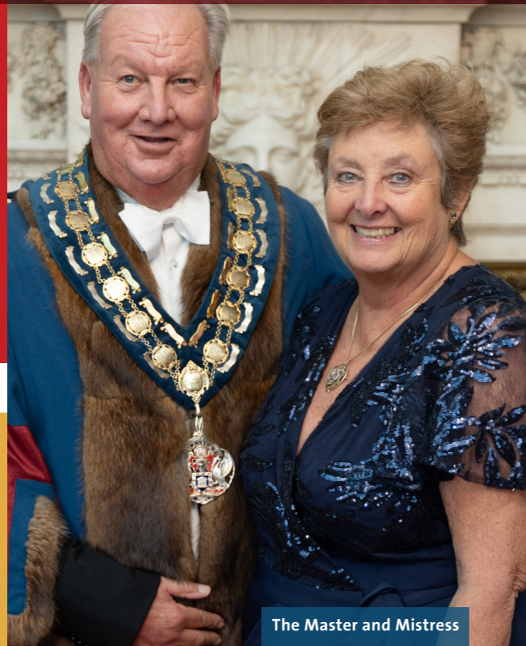
The Master and Mistress