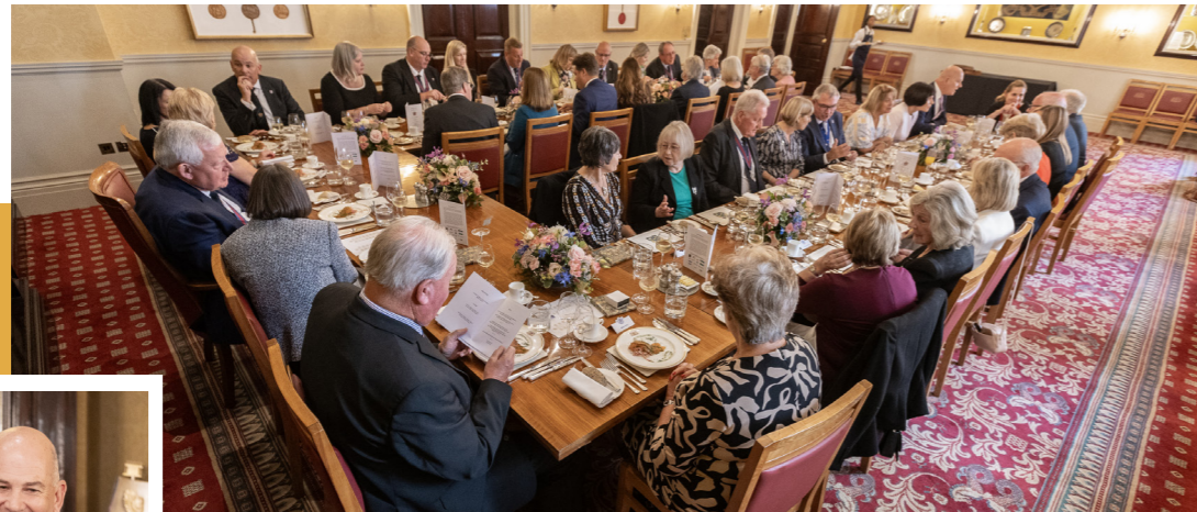
The Court, their consorts and guests gathered at Cutlers' Hall.

This annual lunch sees the Master's consort hand over their badge to the incoming consort.