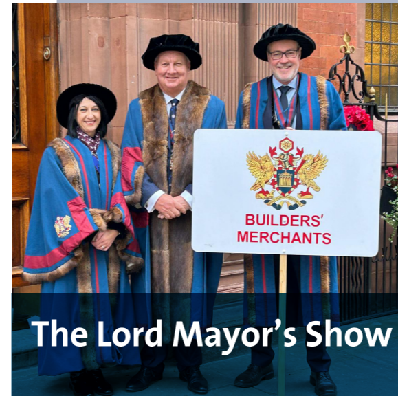
The Lord Mayor's Show