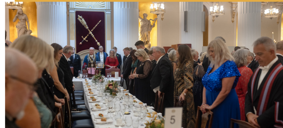
Also present for the evening were representatives from the Beckenham & Penge Sea Cadets and the Company's other affiliates.